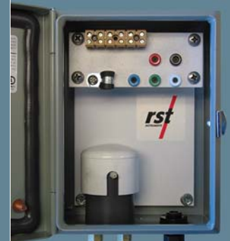
Typical enclosure box.